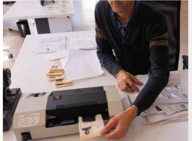
While a temporary ID was being produced in Migration Management office

“ Turkey is still seen as transit and destination country by migrants. ”