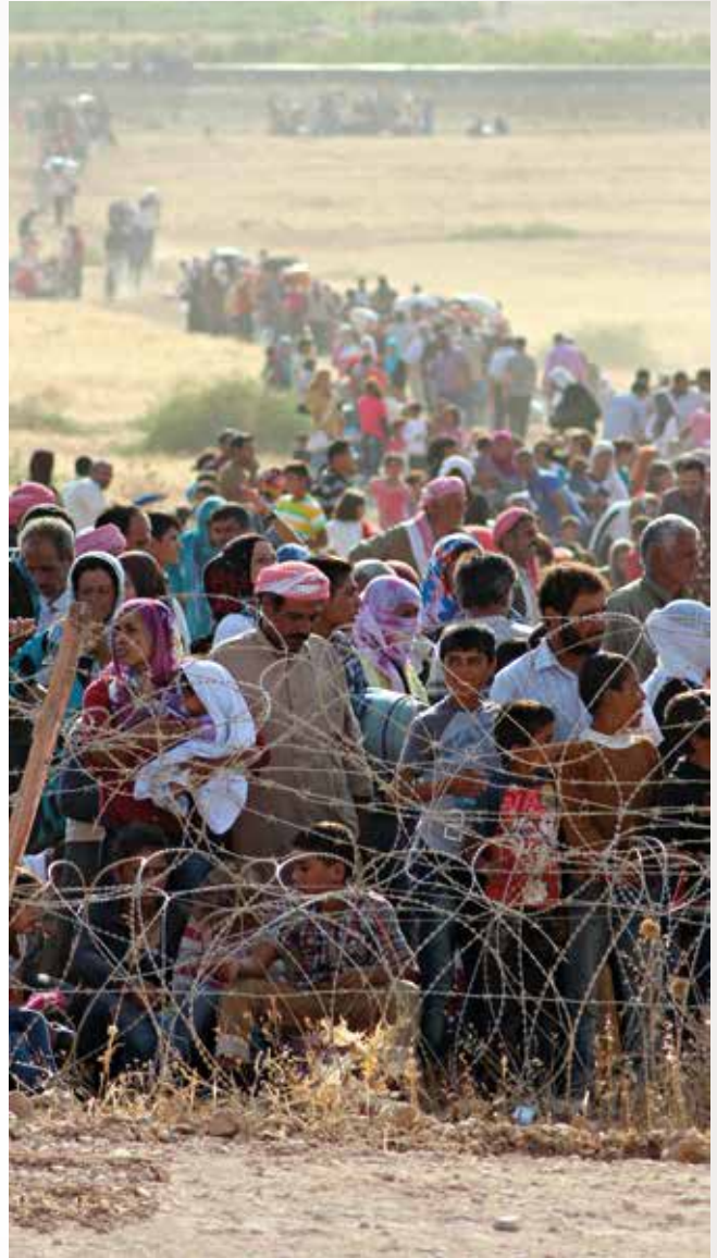
The traces of migration that Turkey faces

With the Law on Foreigners and International Protection, the basis of our national policies in the area of migration and international protection (asylum) has been established and the legal framework for the rights of the refugees and asylum seekers has been adapted to international standards and obligations.