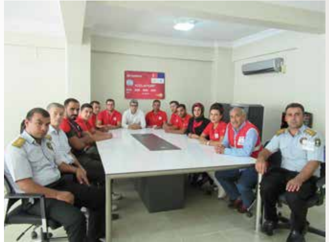
Turkish Red Crescent Haliliye Service Center Staff

We met an elderly lady during the household visits. She asked us that, what we were doing; we stated that we conduct visits to the households for the ESSN Programme. The lady invited us to her house. Together with her two daughters and 5 orphaned grandchildren, we witnessed the struggle of her for survival in very difficult conditions. We contacted the Turkish Red Crescent Service Center to examine her situation. Due to a problem with Mernis registration, we have learned that they have never benefited from the ESSN. We applied to the relevant institutions to solve the problem. As a result of the application procedures, the ESSN cash assistance was provided to the household. This elderly lady we have visited in the following dates, was thanking us; expressed her gratitude to the programme.