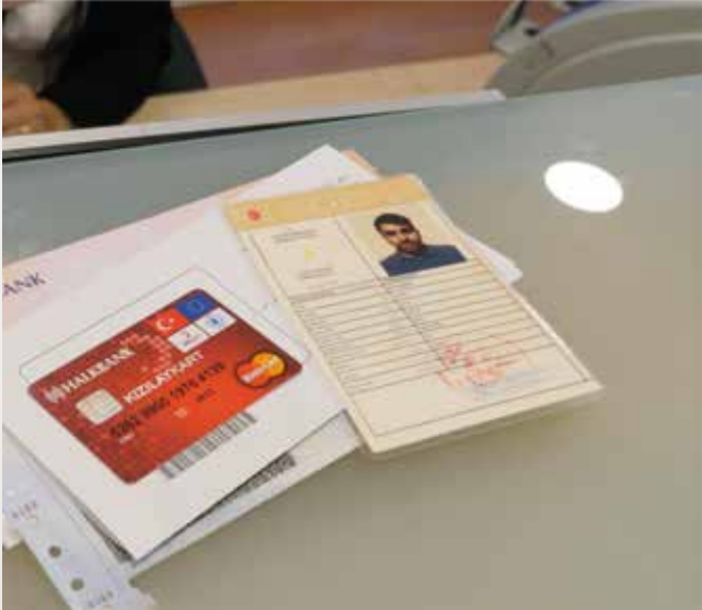
Kızılaykart and Temporary Protection ID Card

“ In accordance with the law no. 6458 on Foreigners and International Protection, the ID number is given to the foreigners by Directorate General of Population and Citizenship Affairs within the framework of the 8'th article of the law no. 5490 on Population Services whose personal information are provided through electronic platform by Directorate General of Migration Management. ”