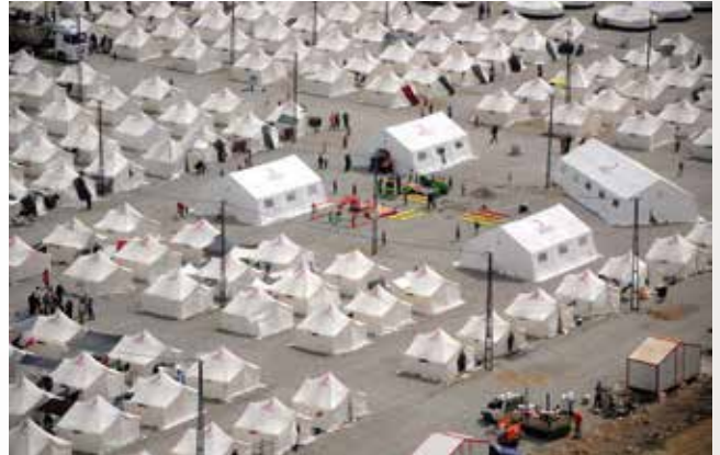
A temporary accommodation center established for refugees within the scope of Syria Humanitarian Aid Operation

Migration is a social fact that has emerged in the trigger of the demands and the needs of the dynamic existence of humanity. From the past to the present day, the mobility of people on the earth has caused social, economic and political changes in terms of the target countries; as well as the emigrant countries and the transit countries along the migration routes. In this respect, migration is considered as a factor that cannot be ignored in the strategic priorities and policies of the states and the internal codes of societies. Migration is closely related with politics, economy, social and cultural life. In particular, international migration affects many states at the same time. Most of the time, it provides labor force to the settled country, brings different skills and new ideas, and on the other hand it can cause loss of skilled labor in the source countries. Therefore, immigration also concerns countries that migrants leave behind as well as the countries they settle in and shape the interaction between these countries and leave permanent traces.