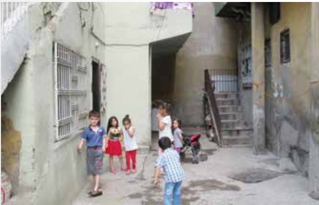
A beneficiary household in Şanlıurfa

The expert in the field takes a picture of the scene encountered in the household and reports it. He doesn't favor anybody, he doesn't misuse his duties. We will check the families again and again through different experts who start to benefit from the SASF Allowance. The SASF Allowance will be carried out for 5% of all applications made through related SASF; for our foundation, this means 50 families. We can visit them every month. I applied the SASF Allowance; I was directed by social scrutiny officer correctly or I was directed wrongly; we will be able to detect it through the multiple visits. The social scrutiny officer prepares the report and submits it to the delegation; the board of trustees will make the decision.