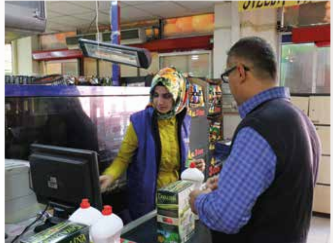
A beneficiary is shopping with the Kızılaykart in the supermarket

The ESSN programme also positively impacts the local economy because people are spending their money in local shops and markets. This contributes to building social cohesion between refugees and the local communities.