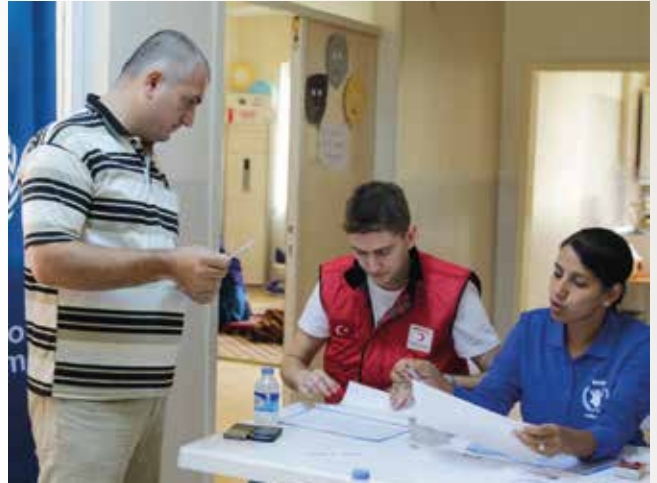
WFP and Turkish Red Crescent staff in a card distribution activity

For both Turkish Red Crescent and WFP, we believe that we know the right response to crisis situations however we need to remain open to learn and improve. I am happy to see that all indicators regarding ESSN show that the assistance is working as the poverty level of our beneficiaries is reducing. The poverty level has reduced from 21% to 11%; so this means before they start getting assistance, they were extremely poor but now the situation is better.