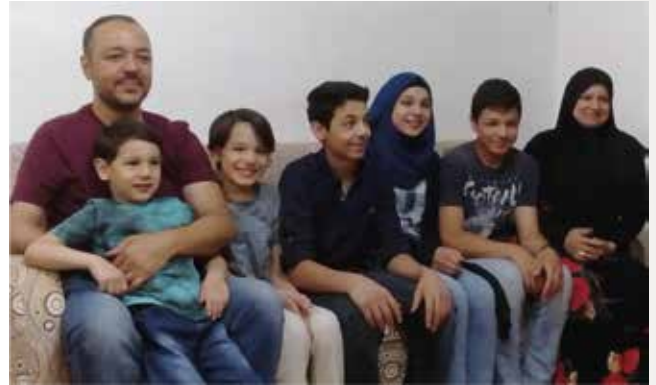
Wais family began a new life in Turkey