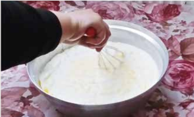
The lady of the house is cooking traditional Lebeniyeye food