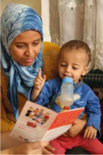
A Kızılaykart beneficiary is looking at the ESSN Programme brochure