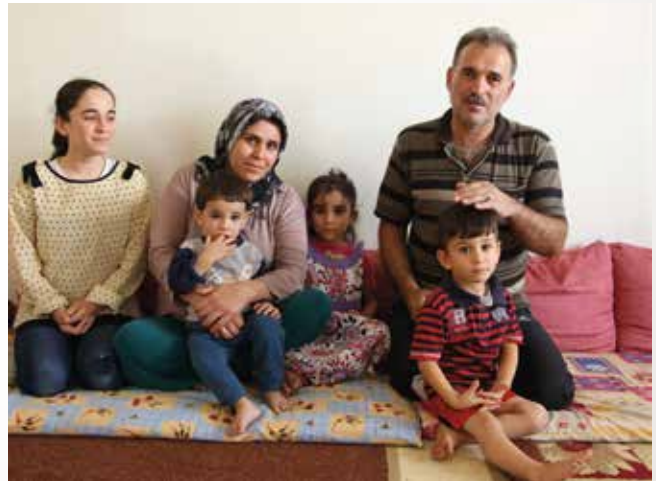
A Kızılaykart beneficiary family living in Gaziantep

“ Something that is very important is that the project provides assistance directly to the beneficiaries and it is very cost efficient. More than 85% of the total amount goes directly to the refugees. ”