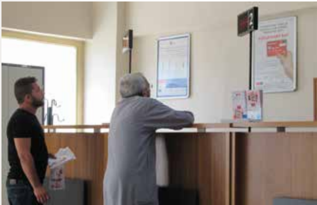
ESSN Applicants in Haliliye Service Center

“ The majority of families who benefit from the ESSN in our city are vulnerable Syrians. ”