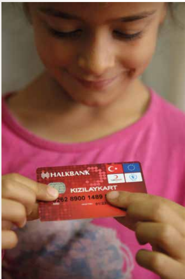
One of the tiny faces of Kızılaykart

“ The CCTE programme uses the same platform as the ESSN and using the Kızılaykart. It is the same card where a family receives complementary cash assistance specifically for education. ”