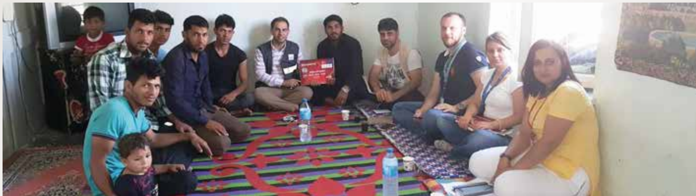
Turkish Red Crescent and WFP staff in a household visit