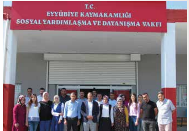
Şanlıurfa Eyyübiye SASF

Can you give information about the coordination / cooperation between Eyyübiye SASF and the cooperated institutions during the implementation process of ESSN Programme?