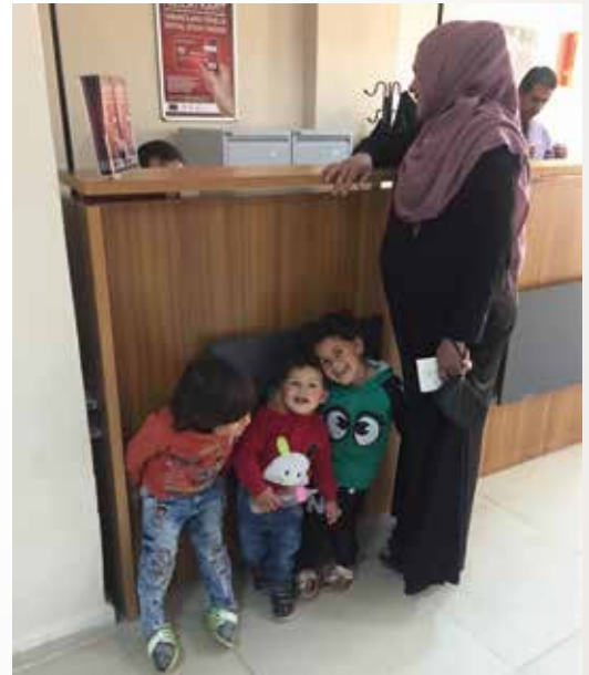
A mother is submitting her official documents to the Service Center