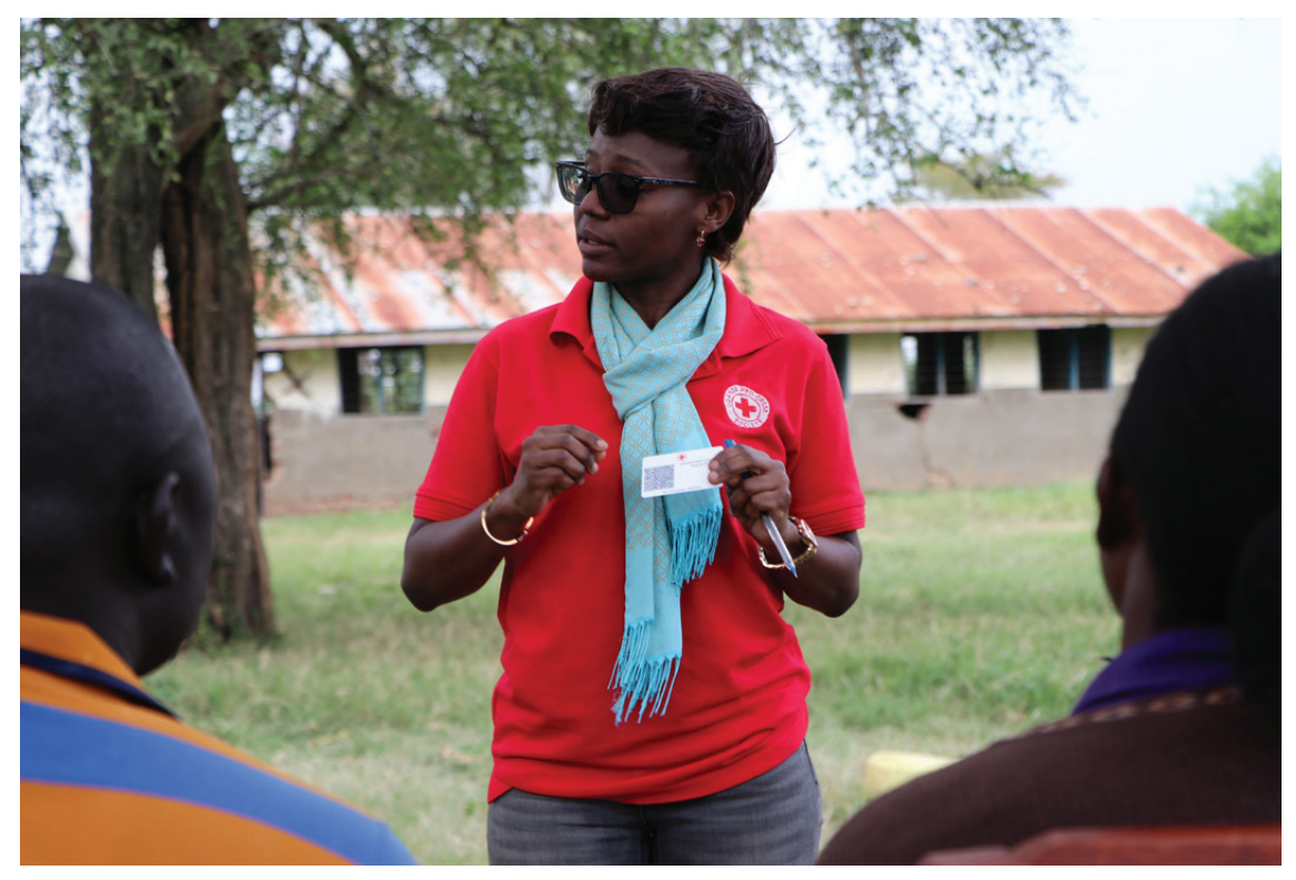
Uganda Red Cross Society facilitating an information session in Bukedea on DIGID.

Many people in Bukedea, a disaster-prone area, lacked official IDs because they were young or they did not qualify to get an ID during registration. However, some people never registered to get their IDs for personal or security reasons, and others have misplaced or lost their IDs. People liked the DIGID digital credentials because it was easy to use and to be verified quickly to access cash assistance. Participants in the pilot project believed the digital credentials could have the potential to facilitate access to other humanitarian services.