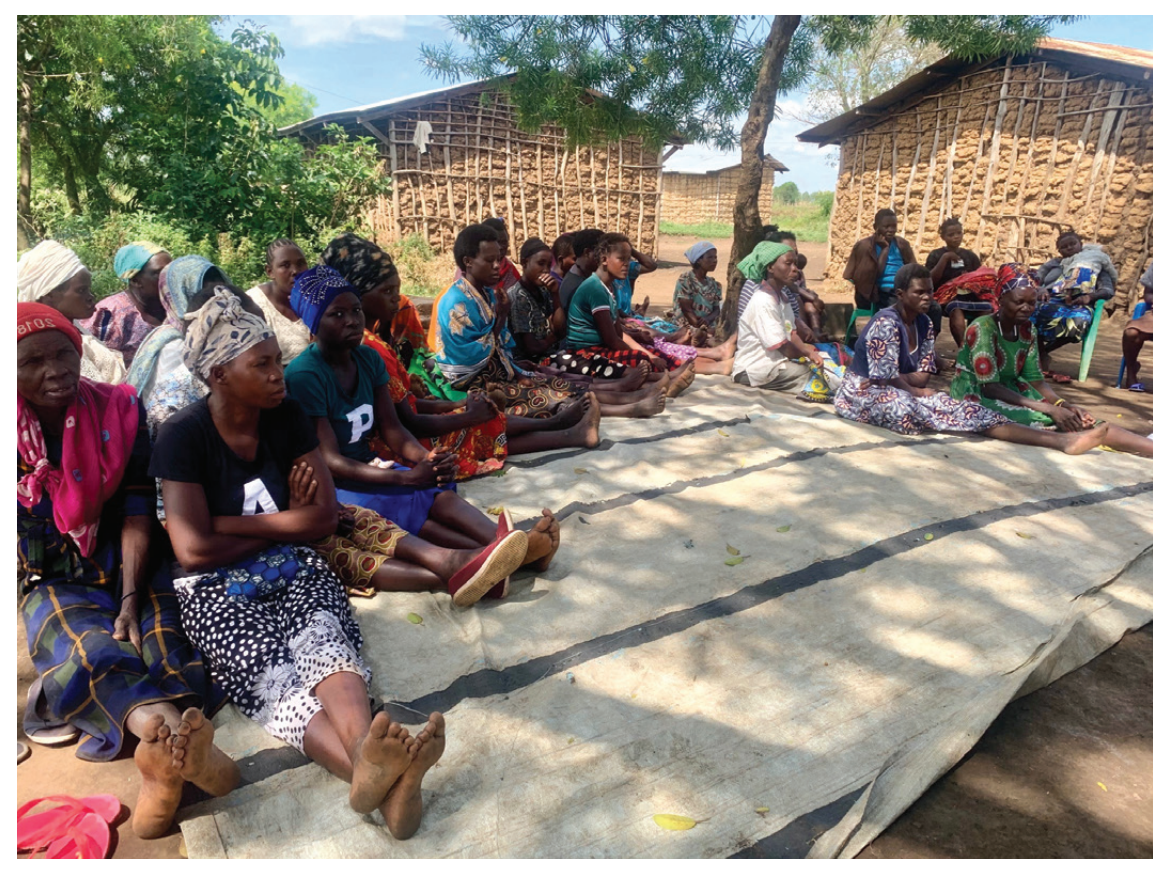
Women from Bukedea during an information session for the DIGID pilot.