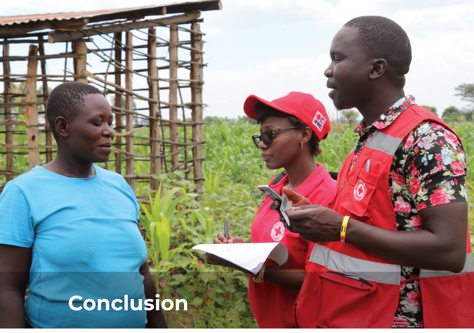
Uganda Red Cross Society staff conducting a post-distribution monitoring exercise following the encashment.

Uganda is advancing in technological innovation, and their application to address humanitarian and development challenges is seen with organisations such as the Uganda Response Innovation Lab (Uganda RIL)<sup>14</sup>, hosted by Save the Children Uganda, convening discussions and promoting innovative projects for the sector. This was one of the reasons why the DIGID consortium selected Uganda as a pilot country for DIGID, where the consortium members' network has a presence. It was in October 2021 that Uganda RIL, Uganda Red Cross Society, and IFRC hosted an online workshop on digital identification for migrants with humanitarian organisations and private sector representatives. The online workshop provided insights into the needs of vulnerable migrants, organisations supporting them, and companies developing solutions to problems such as identification, which helped frame the DIGID project in Uganda.