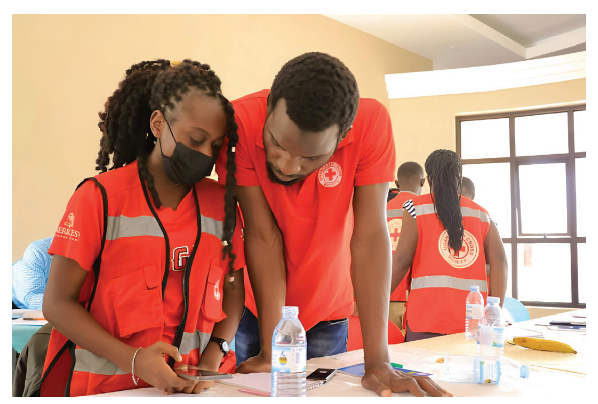
Uganda Red Cross Society volunteers testing the DIGID platform during the simulation in the Isingiro district.