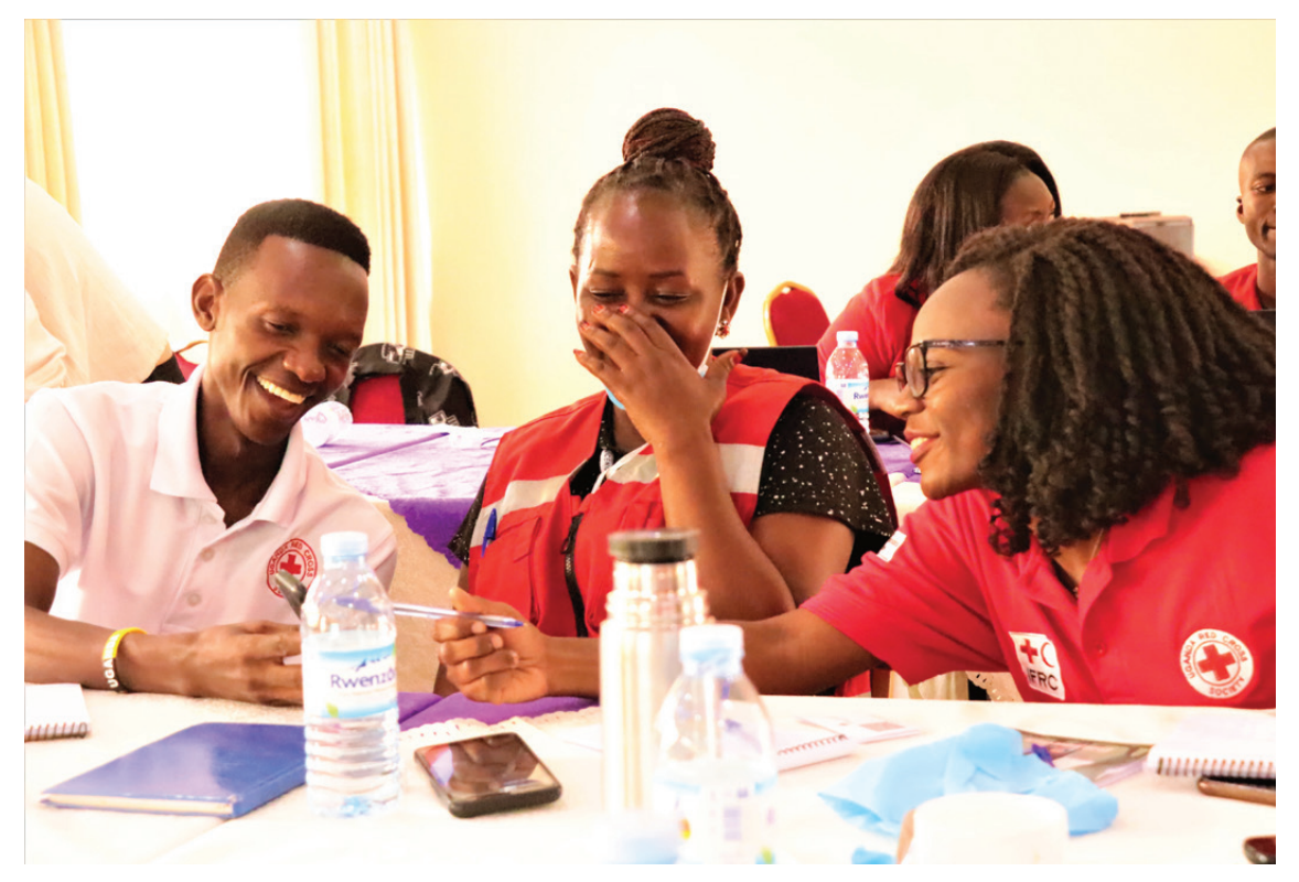
Uganda Red Cross Society staff and volunteers discuss DIGID functionalities during a joint cross-border simulation with the Kenya Red Cross Society in Busia.

Given the concepts and technology is still quite new to many people including URCS staff and volunteers, there were some confusions about the DIGID credentials that were raised during the simulations. For instance, some stakeholders thought DIGID was a beneficiary management system and that they could create as many credentials related to an individual and store them in the wallet. This was clarified by differentiating the systems related to programmatic decision making such as a beneficiary management solution and a system that establishes eligibility based on a minimum set of data, where DIGID fits in. DIGID in a way is a layer above a beneficiary management system, where more information could be stored about households due to the needs of a programme. But DIGID should only have a minimum set enough for people to be recognized and given their assistance. When piloting the DIGID platform in other national societies, the IFRC should clarify the purpose of digital credentials to ensure national society staff and volunteers are clearly aligned.