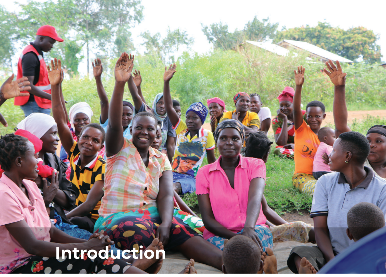
Bukedea women are waiting for the verification process to receive cash assistance.