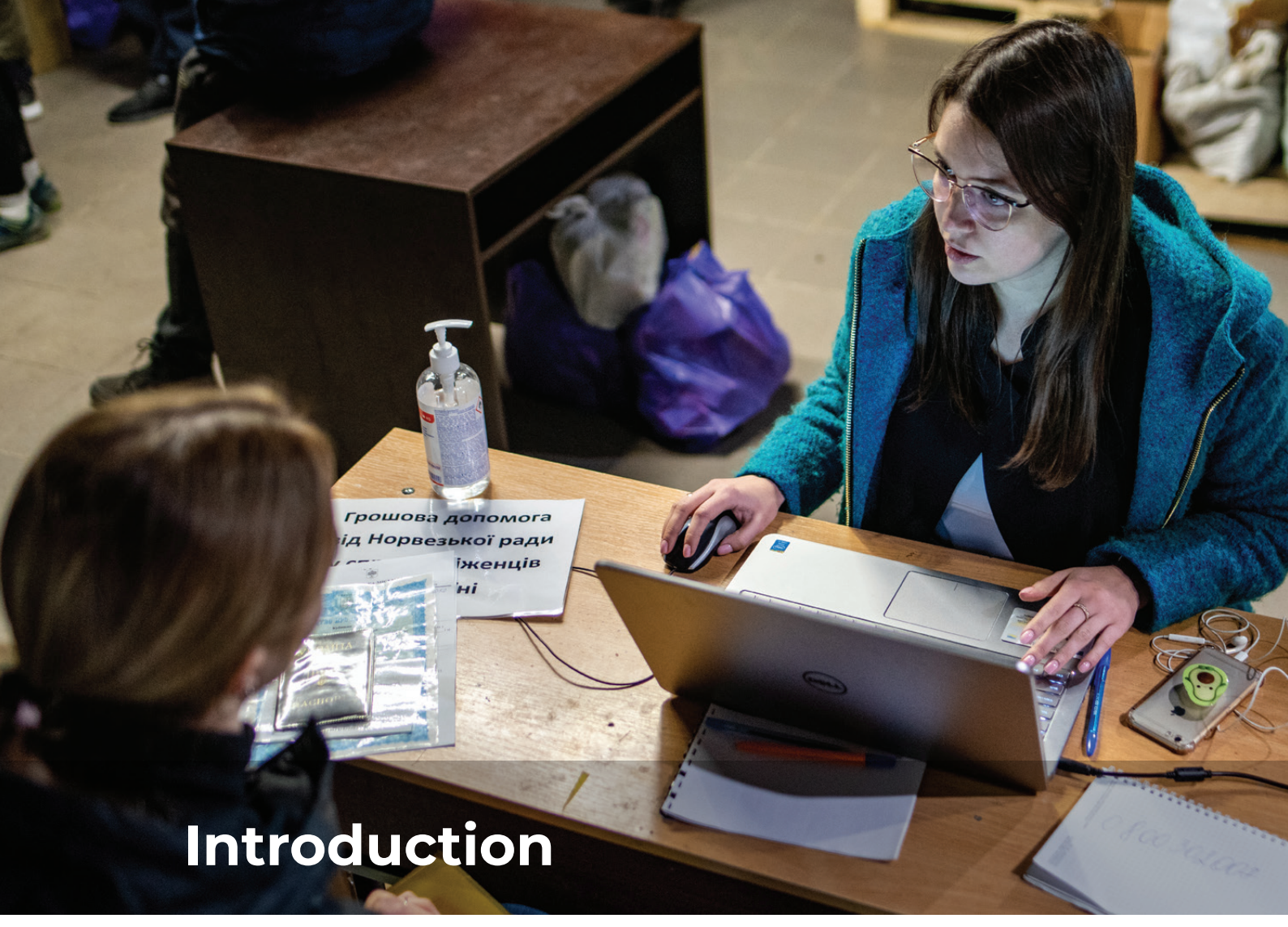
NRC and its longstanding partner, Stabilization Support Services (SSS), register and transfer cash payments to displaced households in the city of Ternopil in western Ukraine.

This landscape mapping study is part of the Interoperability Initiative led by a consortium of humanitarian organizations comprising the International Federation of Red Cross and Red Crescent Societies (IFRC), Norwegian Red Cross, Norwegian Refugee Council and Save the Children Norway. The initiative is funded by the European Commission Directorate-General for European Civil Protection and Humanitarian Aid Operations (ECHO) and IFRC leads the technical implementation. In 2019, the consortium initiated the Dignified Identities in Cash Assistance (DIGID) project aiming at assisting people affected by crisis who do not own an official identity (ID) document and addressing the challenges arising from not having official digital identities.