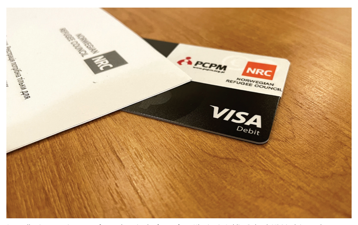
In a collective reception center for newly arrived refugees from Ukraine in Lublin, Poland, NRC is doing cash distribution in cooperation with local partner, Polish Center for International Aid.

Finally, in use case four (Vertical integration – Sharing data on a person with a payments or messaging provider to extend services) we explore the potential cost savings achieved from bulk procurement of financial services. Data from Jordan found that this reduced transfer fees from 2.5 to 1.67 per cent<sup>5</sup>.