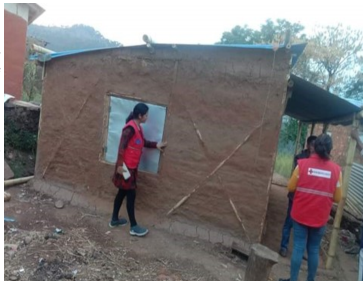
Newly constructed transitional shelter through CVA modality in Mangalsen Municipality, Achham district

Nepal Red Cross Society (NRCS) with the technical and financial support of the IFRC, Danish Red Cross and American Red Cross, implemented earthquake response operation in Doti, Bajhang and Achham districts from November 2022 to May 2023. The core areas of operation were for transitional shelter, WASH, health, PGI and CEA sectors.