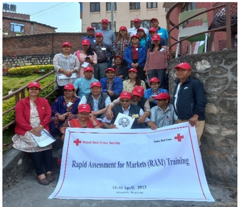
Group photo of RAM Training

The International Federation of Red Cross and Red Crescent Societies (IFRC) standardized course module was delivered via the training. Practical knowledge and skills delivered through experiences and engagement using different case studies for widening the market assessment understandings of participants.