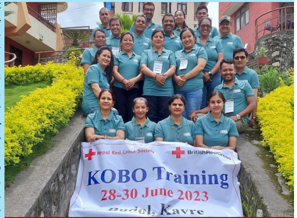
Group photo of KOBO Training

A three-day-long KOBO training was organized from 28-30 June 2023 at NRCS Training Centre Banepa, Kavrepalanchok district by NRCS with financial support of British Red Cross. To run the training, experienced facilitators were used and were PMER Coordinator NRCS Hqs, IFRC country office Nepal Senior IT Officer and IFRC APRO IM Expert from abroad. Those who were involved as facilitators have good experience in KOBO toolbox and data collection. NRCS staff and volunteers from seven provinces and NRCS inter department staff who involved in data collection, monitoring and evaluation roles were the participants of the training. In total 19 participants (female-9) participated in the training. Before the training, all the participants had already completed IFRC online learning platform course named The Fundamental of Field Survey . The objectives of the training were to equip NRCS staff and volunteers with the necessary skills and knowledge to operate KOBO toolbox effectively for data collection, designing and collecting data and able to analyze collected data by using KOBO toolbox as per requirements.