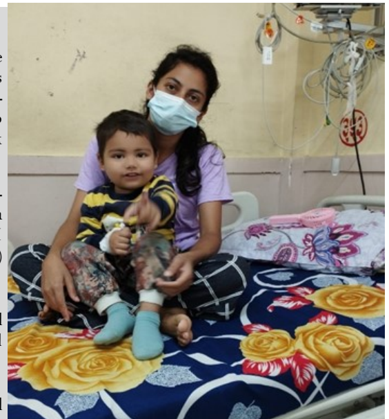
A blood cancer patient with his mother in the hospital

Similarly, under the GESI Department, Empower People with Disability for Inclusive Community Program is being implemented in Lamjung district. Under this program, cash was supported to 16 disabled people on the basis of NPR 20,000 (Twenty thousand only) per person. The cash was provided through to them through their own bank accounts.