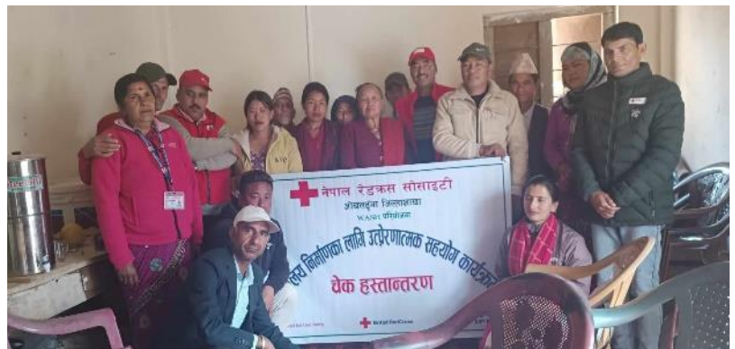
Cheque handover at Molung Rural Municipality Ward No. 3, Okhaldhunga

NRCS has been implementing Sustainable and Inclusive WASH Project in Sindhuli, Okhaldhunga and Ramechhap districts with financial support of the IFRC and the British Red Cross. Under this programme, conditional cash grant NPR 5,000 (five thousand only) was provided to each of 40 vulnerable households of Okhaldhunga to improve their toilets. In total NPR 200, 000 (two hundred thousand only) cash was supported to the affected families. The beneficiaries were provided cash support in cheque as per the objective setup.