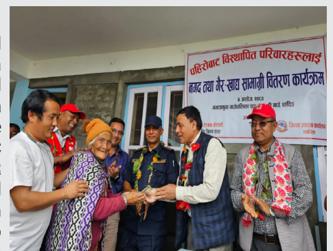
Cash support to flood & landslides effected family in Dhading

After heavy rainfall in August, 53 households were affected by flood and landslides in Ward No. 1 of Ganga Jamuna Rural Municipality in Dhading district. NRCs assessed the situation and found the local market Ganga Jamuna Rural Municipality functional. Thus, responding to the affected families, NRCs with the financial support of DRC provided unconditional multi-purpose cash grant NPR 15,000 (fifteen thousand only) per family to 53 flood and landslides affected families. In total NPR 795,000 (seven hundred ninety five thousand only) cash was supported to the affected families. All the cash was provided through cash in hand.