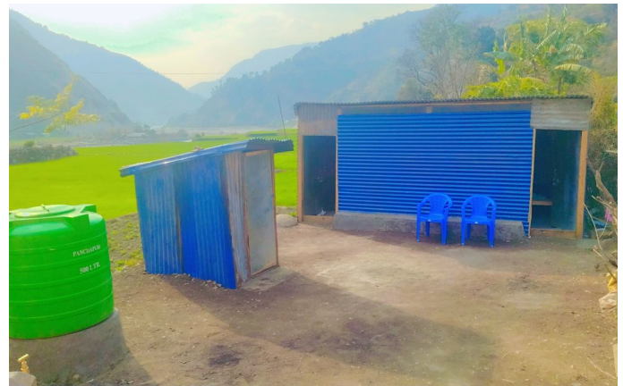
Newly constructed transitional selter & toilet through CVA modality in Bajhang district

NRCs supported first installment cash NPR 25,000 (twenty five thousand only) to each household to construct 250 transitional shelters, NPR 15,000 (fifteen thousand only)