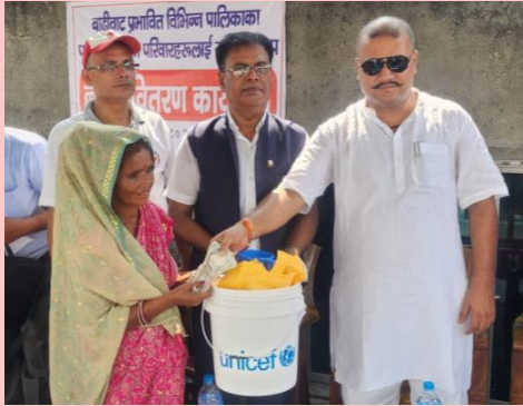
NRCS provided cash to flood affected family in Rautahat

25 houses were affected in Durgabhogawati Rural Municipality, Rajdevi Municipality, Rajpur Municipality, Fatuha Bijayapur Municipality and Gaur Municipality in August 2023 in Rautahat district. Detail assessment findings showed that the local markets in Rautahat district were functional. NRCS, in financial support of DRC, provided unconditional multi-purpose cash grant NPR 15,000 (fifteen thousand only) per family to 25 flood affected families in the above mentioned municipalities. In total NPR 375, 000 (three hundred seventy five thousand only) cash was supported to the affected families. The support was provided through cash in hand.