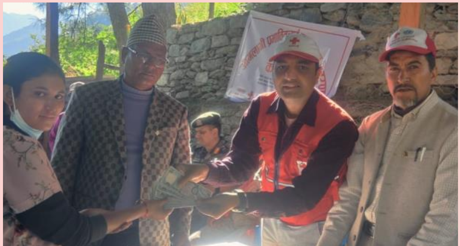
NRCS provided cash to fire affected family in Mugu

The local market at Gamgadi, the headquarters of Mugu district, was functional. NRCS, in financial support of DRC, provided unconditional multi-purpose cash grant NPR 15,000 (fifteen thousand only) to each of these 33 fire affected families in October. In total NPR 495,000 (four hundred ninety five thousand only) cash was supported to the affected families. All the cash was provided through cash in hand. NRCS also provided