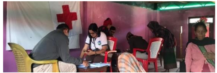
Beneficiaries' bank account opening in Myagdi

NRCS in partnership with the Irish Red Cross is implementing a Community Livelihood Promotion Project in Ranghuganga Rural Municipality of Myagdi district. The first phase of the programme was successfully completed in three wards (1, 4 & 7) of the Raghuganga Rural Municipality, running from 1 March 2019 to 30 June 2022. The second phase of the programme began from 1 July 2022 and will be completed by 31 July 2025 focusing on four wards (ward number 2, 3, 5 & 6). The programme has supported NPR 15,000.00 (fifteen thousand only) to each household for 59 households to support for climate smart farming in the community. In total NPR 885, 000 (eight hundred eighty five thousand only) cash was supported to the affected families. This programme supported to enhance selected beneficiaries to promote cash crops likes kiwi fruit, orange, walnut etc. The cash support was made via bank account.