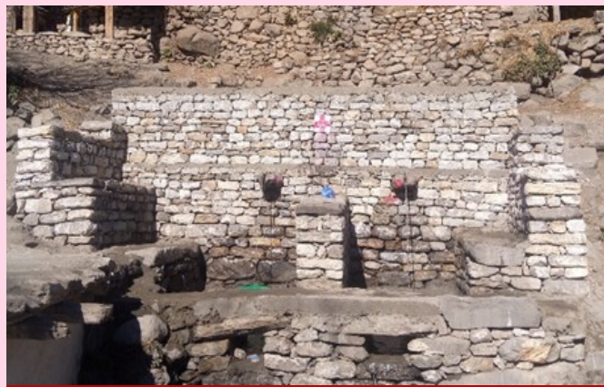
Constructed stone water tap in Tilagufa Municipality ward no. 1, Kalikot district

Integrated Recovery and Emergency Response (IRER) Program is being implemented in Tilagufa Municipality of Kalikot district through a collaboration between the NRCS and Luxembourg Red Cross, running from September 15, 2023, to September 14, 2024. The program addresses the damages caused by the 2022 floods and landslides, focusing on alleviating economic strain, renovating water schemes, schools, health posts, and irrigation systems by providing short-term employment in the communities.