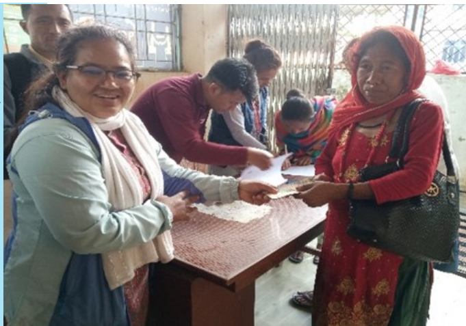
Cash support to pregnant woman in Rukum West district

The provided cash grant was NPR 8,000 (eight thousand only) per woman. In total NPR 1,712,000 (seventeen lakh twelve thousand only) cash was supported. Most of the cash was provided via bank account and only for those who have not their account, cash was provided in hand. The objectives of the cash support were to fulfil basic needs, to provide transport facility for delivery and to reduce delays in care related to obstetric complications of pregnant women. NRCS coordinated with the local government and health unit to select beneficiaries for cash support.