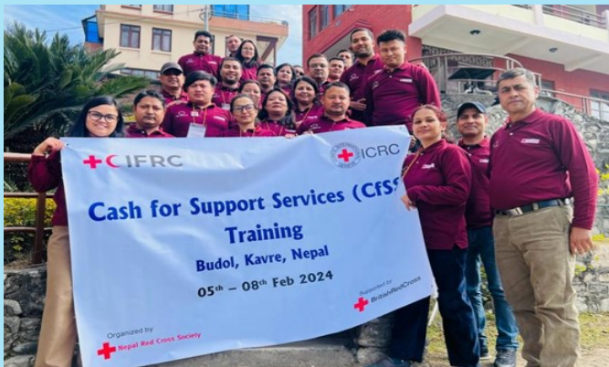
Group photo of Cash for Support Service Training

NRCS, with financial support of British Red Cross, organized a four-day course on Cash for Support Service from February 5-8, 2024, at NRCS Training Centre Banepa. The course was facilitated by Global Logistic Advisor, Asia Pacific Cash Advisor and Senior Finance and Admin Officer of British Red Cross. 24 participants (7 females) from NRCS and Bangladesh Red Crescent Society, related to support services were participated in the training.