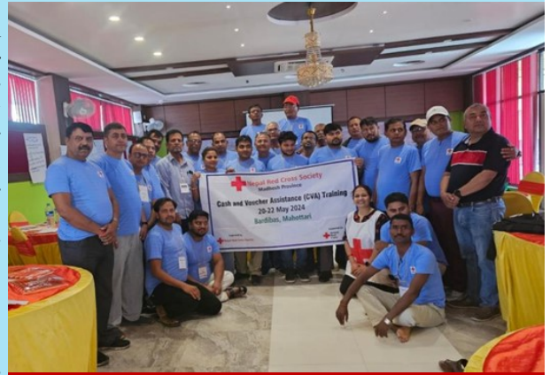
Group photo of CVA Training

The main strategy of the training was to promote the knowledge and skills of the participants through both theoretical and practical exercises, which were integral components of each session. The training course was developed by adopting the IFRC standardized course module by incorporating local context. Practical knowledge and skills were delivered through case studies to broaden participants' understanding of CVA. The training used participatory approaches, including group discussions, demonstrations, question and answer sessions, brainstorming, and simulation exercises.