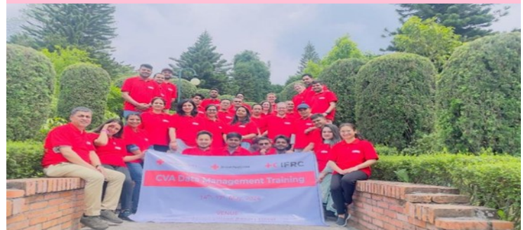
Group photo of CVA IM Training

To enhance the technical competency of staff in survey design, data analysis, visualization and management a four-day CVA IM training was organized from May 14-17, 2024, in Lalitpur district, with financial support from the British Red Cross. The training was facilitated by CVA IM experts from the British Red Cross and the IFRC Asia Pacific Regional Office. A total of 25 participants (8 females) from NRCS, IFRC Nepal, Partner National Societies Nepal, Bangladesh Red Crescent Society, and the British Red Cross attended the training.