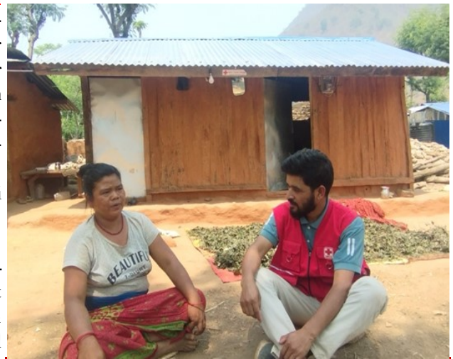
Newly constructed transitional shelter through CVA modality in Bheri Municipality, Jajarkot district

Nepal Red Cross Society (NRCS), in technical and financial support of International Federation of Red Cross and Red Crescent Societies (IFRC), British Red Cross, American Red Cross, Danish Red Cross, Swiss Red Cross and Canadian Red Cross implemented Earthquake Response Operation in Jajarkot, Rukum West and Salyan districts from November 2023 to May 2024. The core areas of operation are for transitional Shelter, WASH, Health, PGI and CEA sectors. NRCS has provided cash support to construct temporary shelter, toilet construction, buying water tank and multi-purpose cash grant to the affected families following the government procedure and in coordination with the government at all levels.