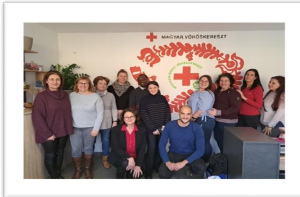
CVA sensitization session in Debrecen County.