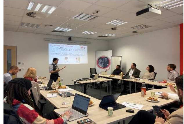
HRC CVA Coordinator and IFRC CEA Delegate presenting in LLW - IFRC Europe regional office, Budapest, Hungary. (Nov. 2023)