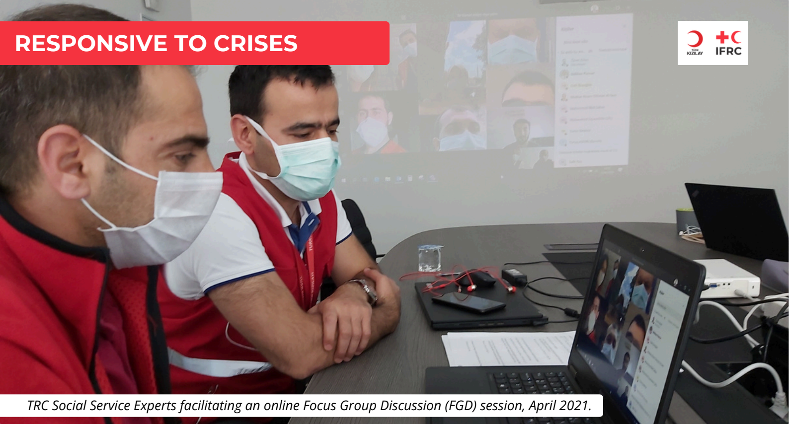
TRC Social Service Experts facilitating an online Focus Group Discussion (FGD) session, April 2021.