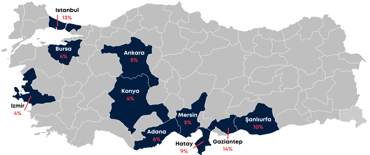
Ten provinces with the highest number of refugees receiving the ESSN. Percentages show how much of the total ESSN recipients resided in these provinces.