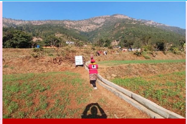
A newly constructed water canal by applying cashfor-work modality in Rukum West

A 6.4 magnitude earthquake struck Jajarkot district on 3 November 2023 at 11:47 local time. The epicenter was located in Ramidanda in Jajarkot district, which claimed the lives of 154 people in Jajarkot (101), and Rukum West (53) district and injuring 366 people. As of December 2024, no major aftershocks have been recorded however, the impact remained quite challenging as more than 75,000 houses were affected by the earthquake in 10 districts out of which Jajarkot, Rukum West and Salyan districts were badly affected. Up to April 2024, NRCS supported response related activities including transitional shelter and toilet construction.