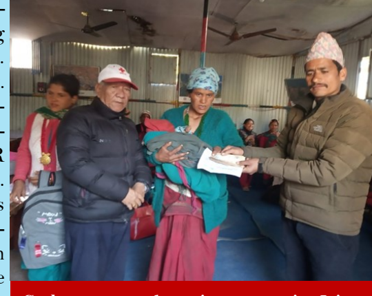
Cash support to lactating woman in Jajarkot

NRCS provided unconditional multi-purpose cash to 970 (Jajarkot-540 and Rukum West-430) marginalized pregnant and lactating women in earthquake affected Jajarkot and Rukum West districts. The provided cash was NPR 8,000 (eight thousand) per beneficiary. The cash was provided through the beneficiaries' personal bank accounts and IME. Similarly, in Kavre 171 flood and landslides affected, marginalized pregnant and lactating women have received NPR 12,000 (twelve thousand) based on severity and identified needs. The cash was supported via beneficiaries' personal bank accounts and cash-in- hand modalities. NRCS coordinated with the local government and health unit to identify and select beneficiaries for cash support. In total, NPR 9,812,000 (nine million eight hundred twelve thousand) was supported to these women in three districts through the partnership of United Nation Population Fund (UNFPA).