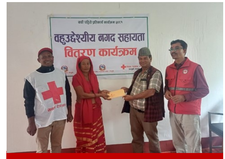
Multipurpose cash support to flood affected beneficiary in Sindhuli

Nepal Red Cross Society (NRCS), with technical and financial support from Red Cross and Red Crescent Movement partners, implemented Flood and Landslide Operation and provided multi-purpose unconditional cash assistance to 2,240 households in Kavrepalanchok, Sindhuli, Ramechhap, Makawanpur,