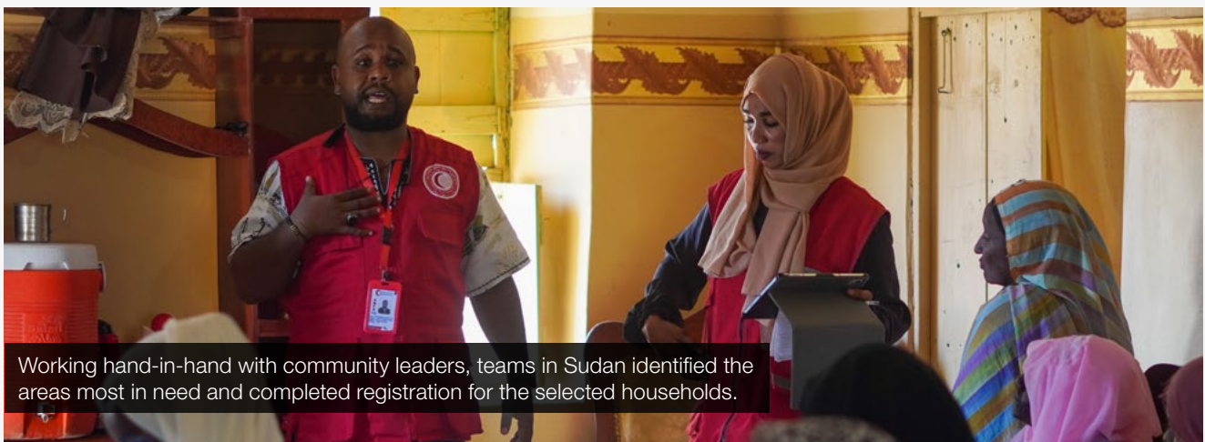
Working hand-in-hand with community leaders, teams in Sudan identified the areas most in need and completed registration for the selected households.

Data protection. National Societies often collect or process data to support people to access cash, for example through setting up bank accounts, or comparing data with the authorities and other actors to complement existing support and social protection registers. Migrants face unique risks around the exposure of their data. Many are fleeing persecution and fear sharing personal information due to potential discrimination or access to their data by the authorities, which can mean they don't register for assistance. 11 National Societies should assess their digital capacity to avoid exposing migrants to greater risks by ensuring data protection processes are in place and that migrants are aware of them, and that the authorities understand their need to operate independently and to protect the people they support.